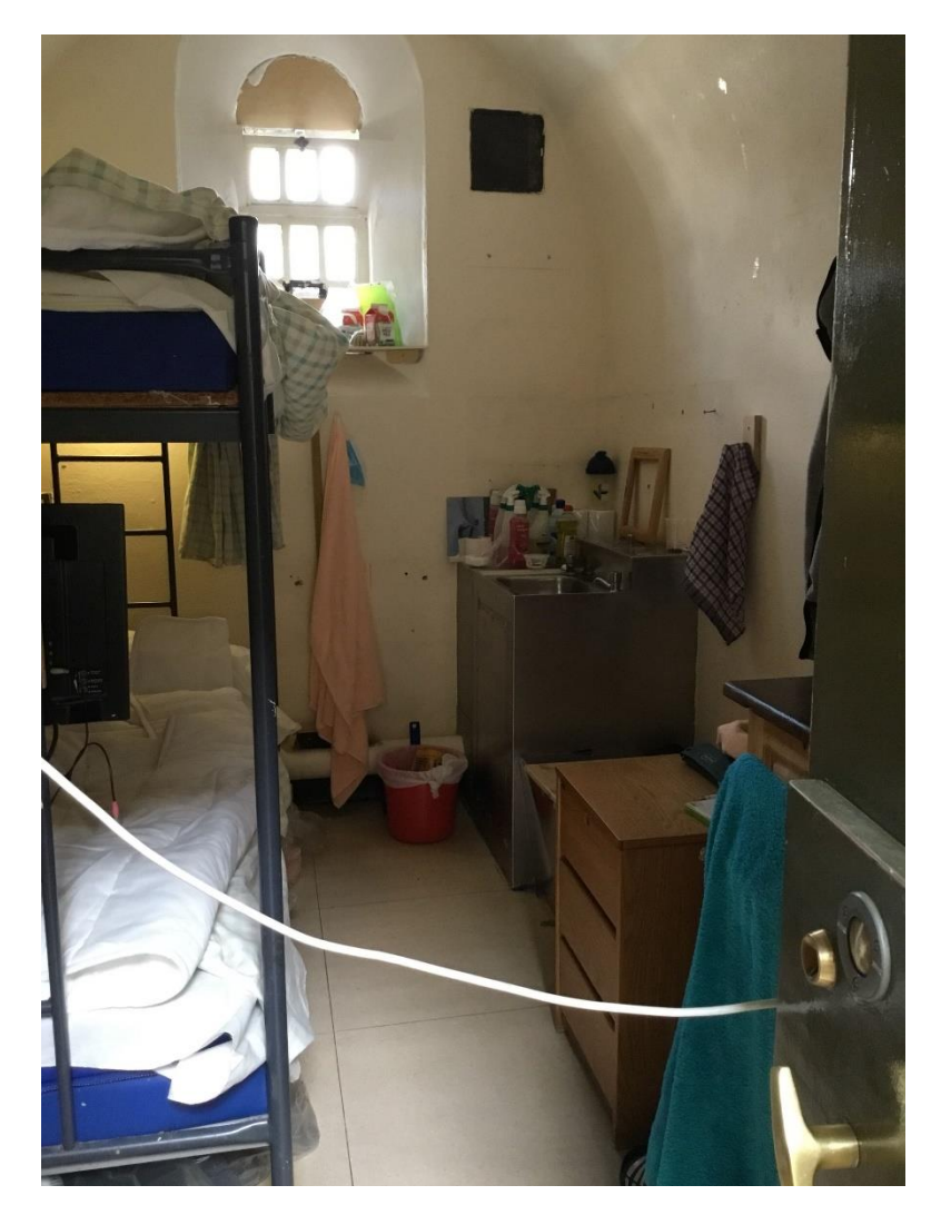
Figure 5: Double-Occupancy Cell, Photo 2