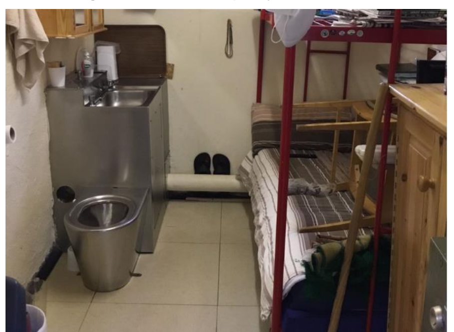
Figure 4: Double-Occupancy Cell, Photo 1